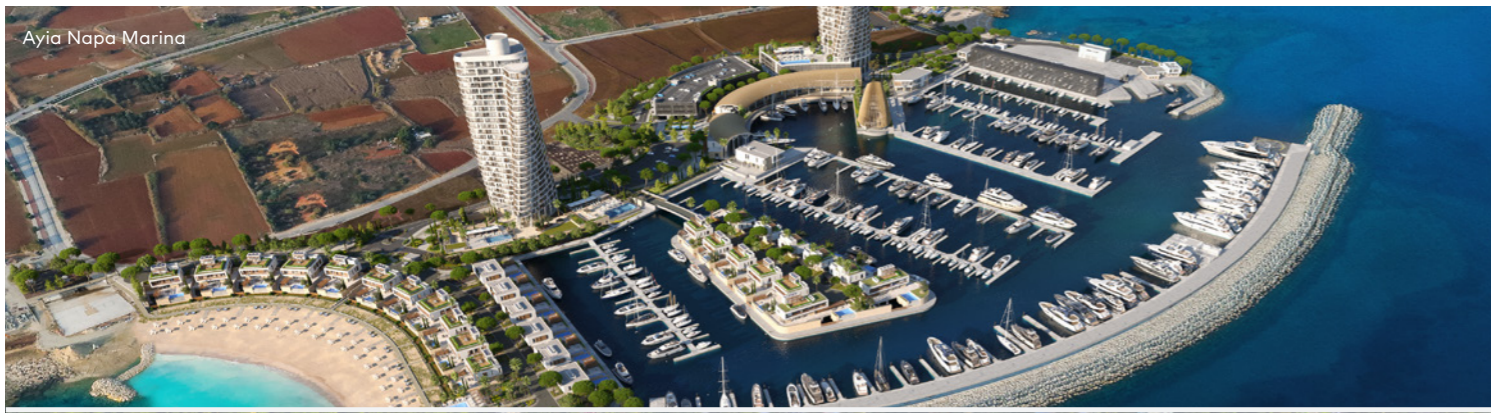
Ayia Napa Marina